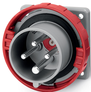
Flush Mounting - IP67 Code: 248.1696RV