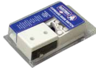
Lever Type - Cupboard Door Switch