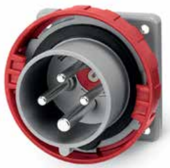
Flush Mounting - IP67 Code: 248.1696RV