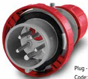
Plug - IP67 Version Code: 218.3237RV

Or you can use a “phase inverter” plug from Scame’s OPTIMA Series which will immediately solve your problem with one simple move!