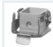
C146 10F 003 0004 Surface Mount Base Straight Open 1 Lever, Plastic W 28 L 40 D 22