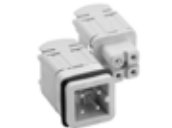
C146 10B 004 0024 Female Insert Screw Terminal W 21 L 21 D 39