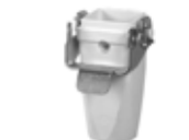
C146 10G 003 8044 Cable Mount Base PG11, 1 Lever, Plastic W 27 L 37 D 50