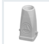
C146 10G 003 6004 Top Entry Hood PG11, 2 Stud, Plastic W 27 L 34 D 50