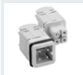
C146 10A 004 0024 Male Insert Screw Terminal W 21 L 21 D 39