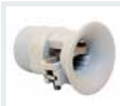
C146 VN16 110 0004 Trumpet Strain Relief, PG11 Cable < 10.5mm