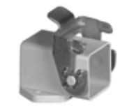
C146 10F 003 0044 Surface Mount Base Angled, Open 1 Lever, Plastic W 41 L 40 D 26

Other non C146 series accessories available: