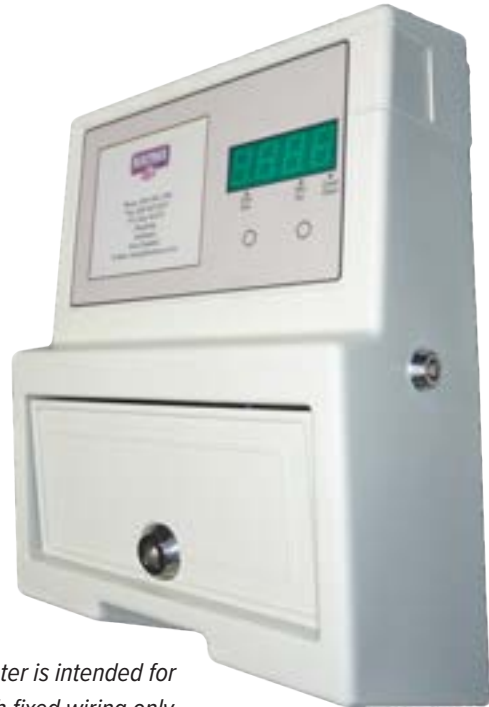
This meter is intended for use with fixed wiring only.

1989 EMC directive Generic Standards EN50081-1, EN50082-1