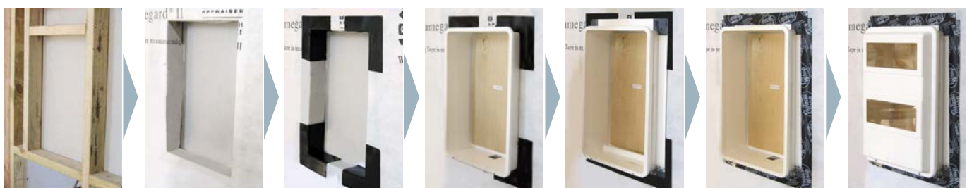
Frame to fit meter box

METER BOXES, PVC PANELS, DIN RAIL & GASKETS