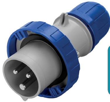
Socket Front View