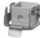
C146 10F 003 0004 Surface Mount Base Straight Open 1 Lever, Plastic W 28 L 40 D 22