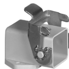
C146 10F 003 0044 Surface Mount Base Angled, Open 1 Lever, Plastic W 41 L 40 D 26

Other non C146 series accessories available: