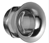
C146 VN16 210 0002 Trumpet Strain Relief, PG21 (Cable < 21.0mm) C146 VN16 290 0002 Trumpet Strain Relief, PG29 (Cable < 30.0mm)