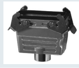
C146 10G 016 8021 Cable Mount Base, PG21, 2 Lever W 43 L 94 D 62 C146 10G 016 8038 Cable Mount Base, PG29, 2 Lever W 43 L 94 D 76