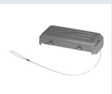
C146 10Z 016 1001 Protective Cover, 4 Stud W 44 L 97 D 20

Other non C146 series accessories available: